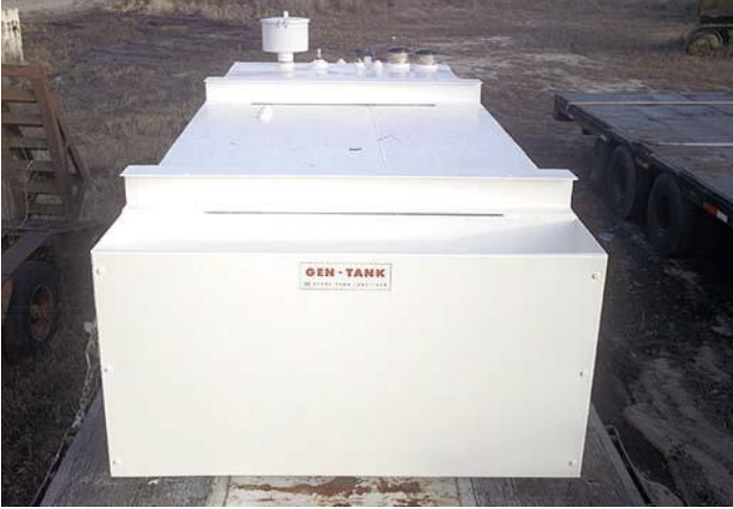
Low profile design enables structural support for the generator mounting

GEN-TANK Generator Base Tank provides sturdy support for your backup or emergency power generator. The low profile of the GEN-TANK design serves as the structural support for the generator mounting, while providing storage for a complete supply of generator diesel fuel.