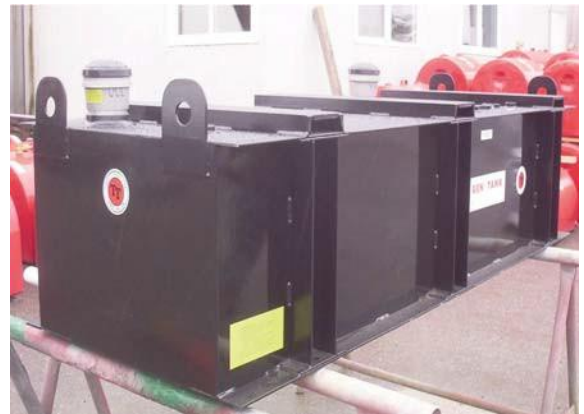
Compatible with a wide range of fuels and chemicals, including conventional diesel and biodiesel