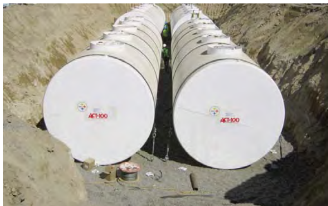
Compatible with a wide range of fuels and chemicals, including biodiesel and ethanol

PROTECT THE ENVIRONMENT. BUY RECYCLABLE STEEL TANKS.