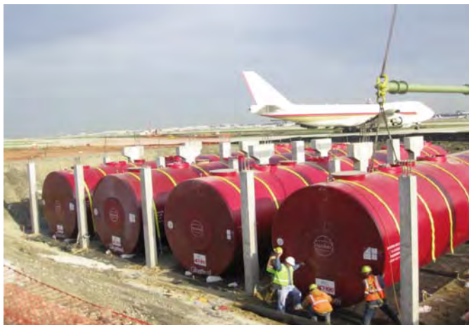
Features the strength of steel with a 100-mil fiberglass outer coating

ACT-100® Steel/FRP composite tank features a strong steel tank for structural integrity, and a 100-mil fiberglass outer coating for long-lasting corrosion protection. Double-wall design allows continuous interstitial leak detection and monitoring.