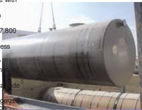
AquaSweep™ Installation at Chicago's O'Hare International