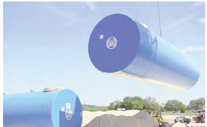
Compatible With a Wide Range of Fuels and Chemicals, Including Biodiesel and Ethanol

PROTECT THE ENVIRONMENT. BUY RECYCLABLE STEEL TANKS.