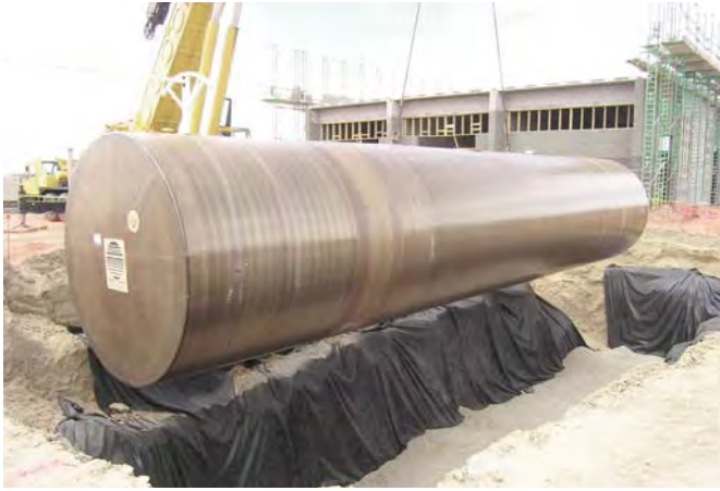
Meets EPA Leak Detection Requirements for Underground Storage Tanks

PERMATANK® double-wall jacketed underground storage tank features an inner steel tank coupled with an exterior corrosion-resistant fiberglass tank. A unique standoff material separating the inner and outer tanks creates a uniform interstitial space ensuring rapid and accurate leak detection.