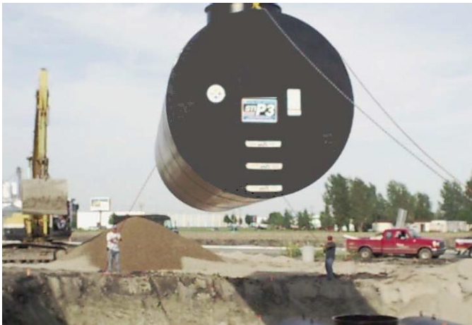
The only UST design which allows on-going monitoring of corrosion protection

sti-P 3 ® double-wall underground storage tank features a pre-engineered corrosion protection system that provides ongoing monitoring of corrosion protection. The sti-P 3 ® system has provided reliable, long-term performance for over a quarter million steel underground storage tanks.