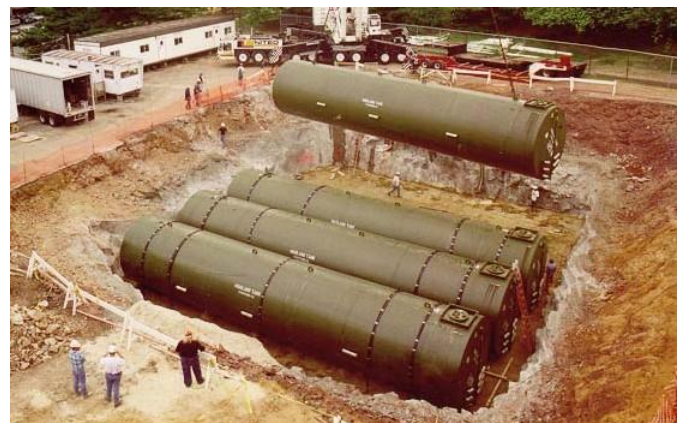
Compatible with a wide range of fuels and chemicals, including biodiesel and ethanol

PROTECT THE ENVIRONMENT. BUY RECYCLABLE STEEL TANKS.