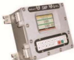
Toptech MultiLoad II SMP

The Liquid Controls Group packages your meter with a selection of proven register and flow computer options manufactured by LCG. Engineered packages are available for high-end, automated batching and blending systems, as well as for basic electronic preset or mechanical registration systems. Meter-mounted LCG POD pulser available for pulse output to electronic register. Contact Liquid Controls Group for additional information.