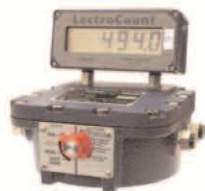
LectroCount Electronic Register