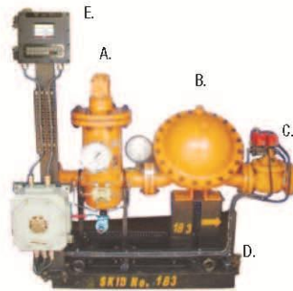
A. Strainer/air eliminator B. Meter C. Valve D. Skid mount E. Toptech MultiLoad II SMP