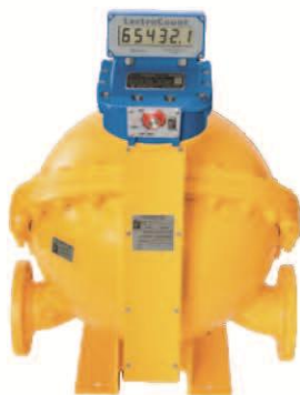
Steel Case Meters