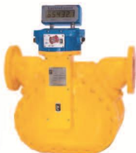
Aluminum Body Meters

1½", 2", 3", 4", 6" NPT, BSPT or slip w/ekt companion flanges. Optional RF or FF ANSI.