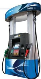
The Ovation fuel dispenser The original revolutionary design featuring a sleek and stylish look

The Ovation dispenser's sleek and stylish look was developed in partnership with IDEO, one of the world's most renowned design firms. Exhaustive market research was used to create the Ovation dispenser — a fuel pump focused on the consumer. From its modern look and intuitive ATM-style soft-key interface to its clutter-free, side-drape hoses and fast fueling rates, the Ovation dispenser is designed to deliver an exceptional customer experience that increases customer loyalty and your site throughput. The Ovation fuel dispenser is in a class by itself.