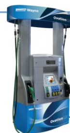
The Ovation LX fuel dispenser The optimal customer experience featuring the award-winning iX Technology platform