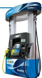
The Ovation Eco Fuel dispenser Add alternative fuels to your product offering

Dresser Wayne Ovation fuel dispensers are an investment you can count on for the long haul. They feature a durable exterior that has been built to last in the harshest of forecourt environments. Easy-access hinged doors and standardized components make service easy, and the entire dispenser is backed by Dresser Wayne's standard two-year warranty. Unlike other dispensers, Ovation dispensers can easily be customized and upgraded to meet your evolving business needs. The Ovation fuel dispenser delivers a lifetime of value.