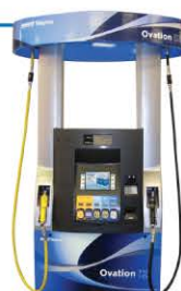
The Ovation dual hose blender dispenser A wide range of ethanol and alternative fuel grade options