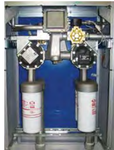
Select UHC Series features high flow Liquid Controls meters, dual internal 40 GPM filters per meter, and a streamlined flow path to provide maximum flow performance and clean fuel