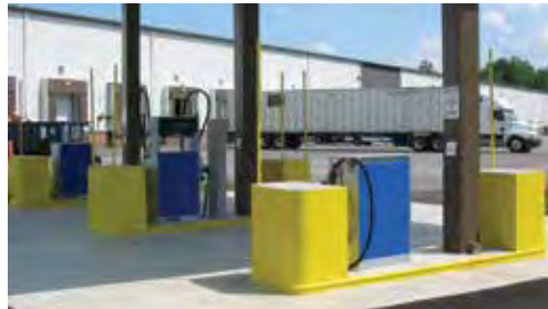
Master and satellite models allow for the convenient and quick fueling of trucks with saddle tanks