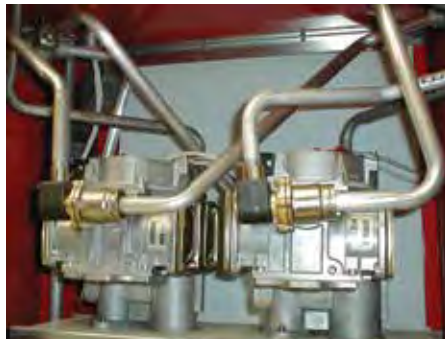
Select SHC Series utilizes two Wayne electronic iMeters manifolded to each hose for superior flow performance