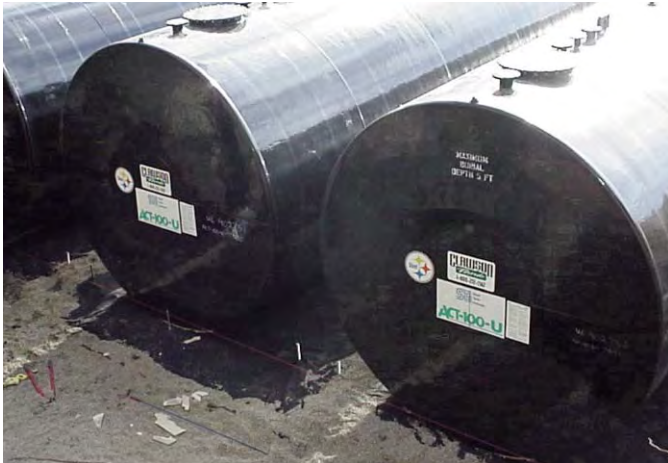
Single or double-wall construction available

ACT-100-U ® tank features a strong inner steel tank for structural integrity, and a thick urethane outer coating for long-lasting corrosion protection. The ACT-100-U ® provides a barrier from corrosion comparable to a fiberglass reinforced plastic coated (composite) steel tank.