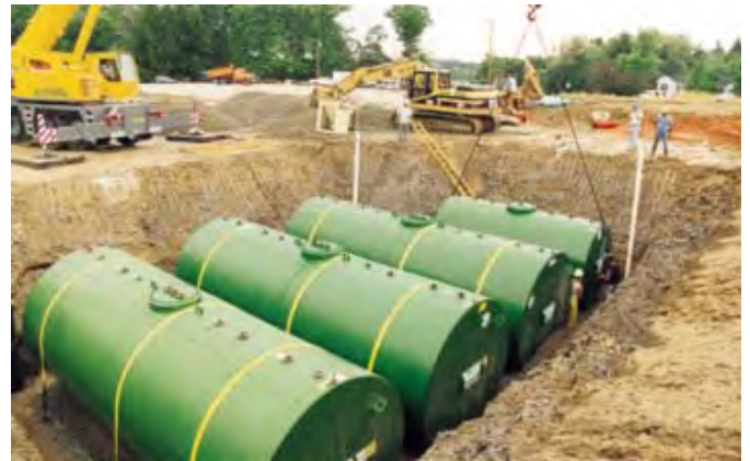
Compatible with a wide range of fuels and chemicals, including biodiesel and ethanol

PROTECT THE ENVIRONMENT. BUY RECYCLABLE STEEL TANKS.